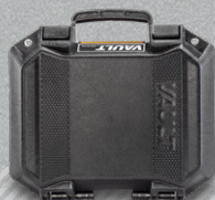
V100 SMALL CASE

Your favorite gear deserves a Vault by Pelican case. Our all-new line of hard cases gets you more protection for your money. In toughness and weather resistance, we've given the "off brands" a new challenge. Engineered with an optimized blend of materials and production methods that all add up to unmatched confidence – and value.