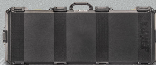
V730 LONG CASE

EXTERIOR DIMENSIONS 47.12" L 19.18" W 6.90" H