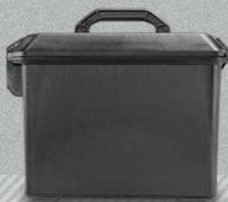
V250 LARGE CASE

EXTERIOR DIMENSIONS 16.27" L 7.90" W 11.93" H