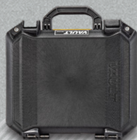
V200 MEDIUM CASE

EXTERIOR DIMENSIONS 15.41" L 13.08" W 6.16" H