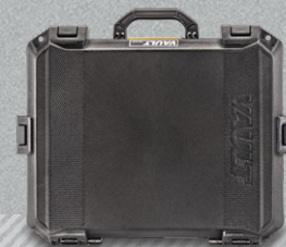
V550 LARGE CASE

EXTERIOR DIMENSIONS 22.42" L 17.46" W 9.16" H