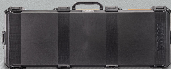
V800 LONG CASE

EXTERIOR DIMENSIONS 56.11" L 19.15" W 6.65" H