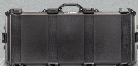
V700 LONG CASE

EXTERIOR DIMENSIONS 39.61" L 17.65" W 6.65" H