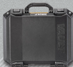
V300 LARGE CASE

EXTERIOR DIMENSIONS 17.54" L 14.21" W 7.16" H