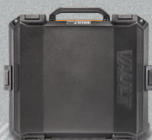
V600 LARGE CASE

EXTERIOR DIMENSIONS 24.55" L 20.59" W 10.16" H