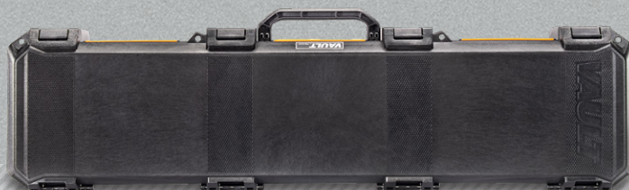
V770 LONG CASE

EXTERIOR DIMENSIONS 51.47" L 13.15" W 6.65" H